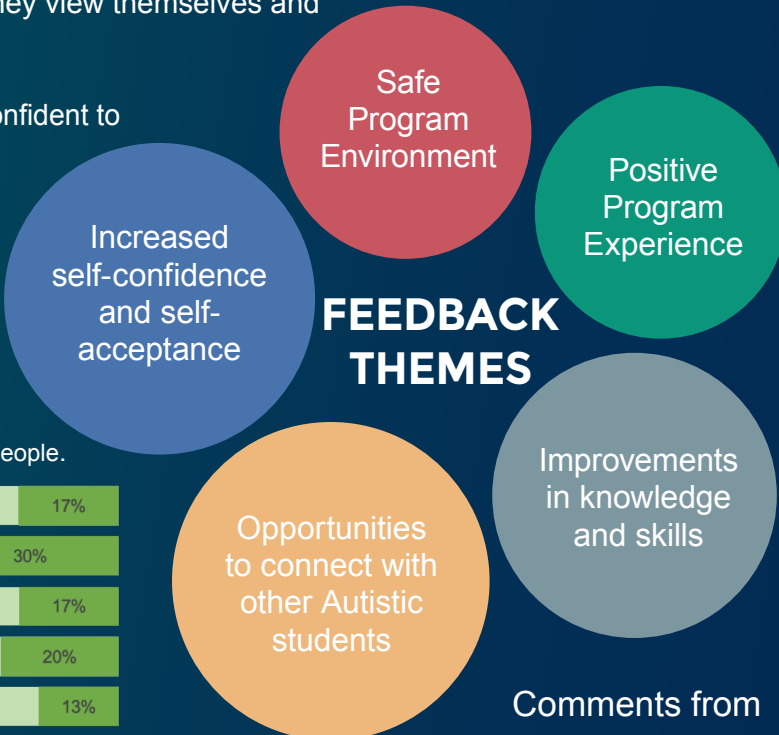
Changes among I CAN School® students in engagement with other people.